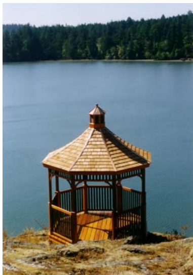
The Classic Cedar CCG-12 Gazebo.