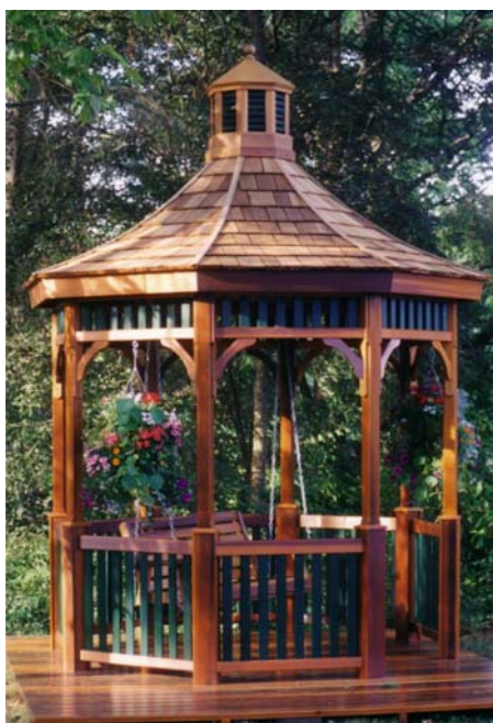
The Classic Cedar CCG-9 Gazebo with Porch Swing.

Enjoy your elegant outdoor spaces—whatever the weather.