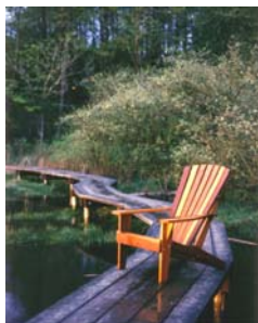
Classic Cape Cod Chair

A few examples of other award-winning outdoor living designs from Classic Cedar: